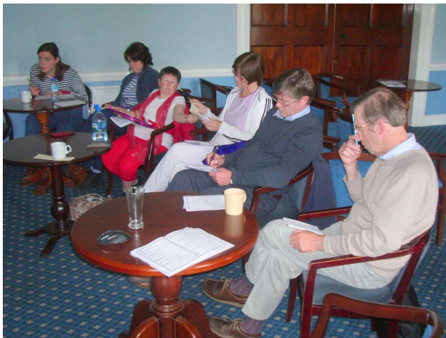
Some participants in studious mood