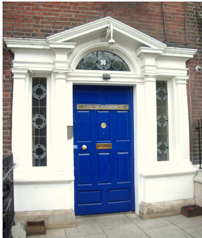
Club na Muinteoiri / Teachers Club, the Georgian House where the renku was held